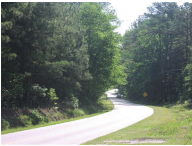
Figure 1 view from Road