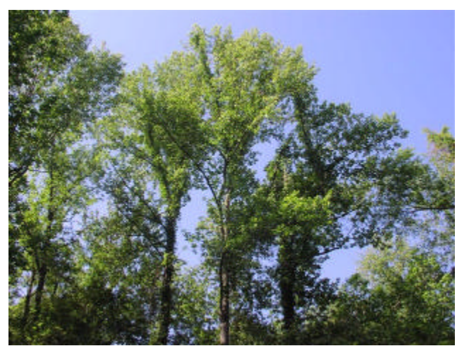
Figure 3. Vegetation