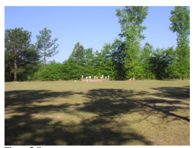
Figure 5 Cemetery