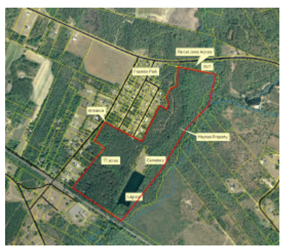
Figure 7 Property off Cabin Creek