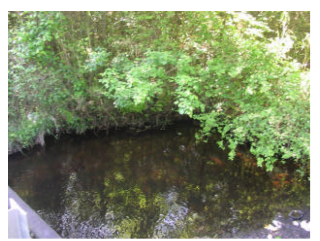
Figure 2. Cabin Creek