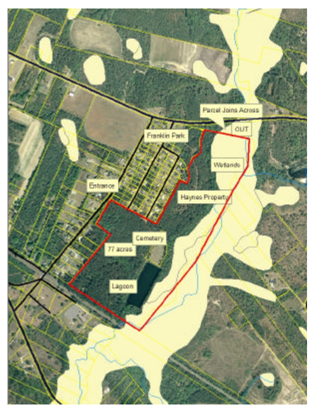
Figure 8 Significant Wetlands on Cabin Creek